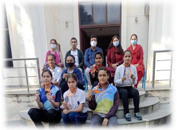
Inter College Fencing Held at University of Jammu in which 7 silver and 8 bronze medals were won