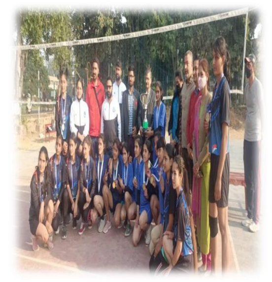
Volley Ball Team got Silver Medals In Inter Collegiate Volleyball Women Trophy Organized By University Of Jammu