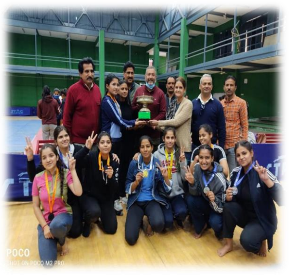
Overall championship trophy in the Inter-College Women's Wrestling Championship held at University of Jammu