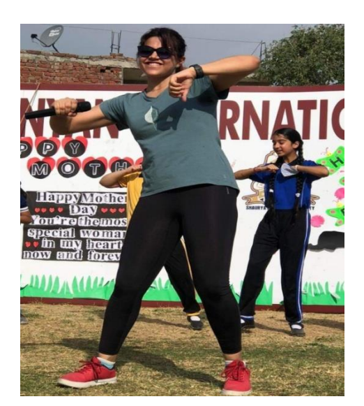
A fitness session on Mother's day 2019

She has been holding regular fitness workshops for students.